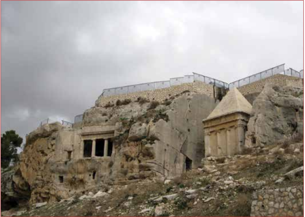
Zechariah's Tomb (right) and Tomb of Benei Hezir