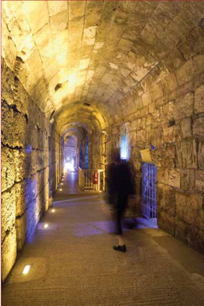
Part of the Western Wall Tunnels from the early Islamic period