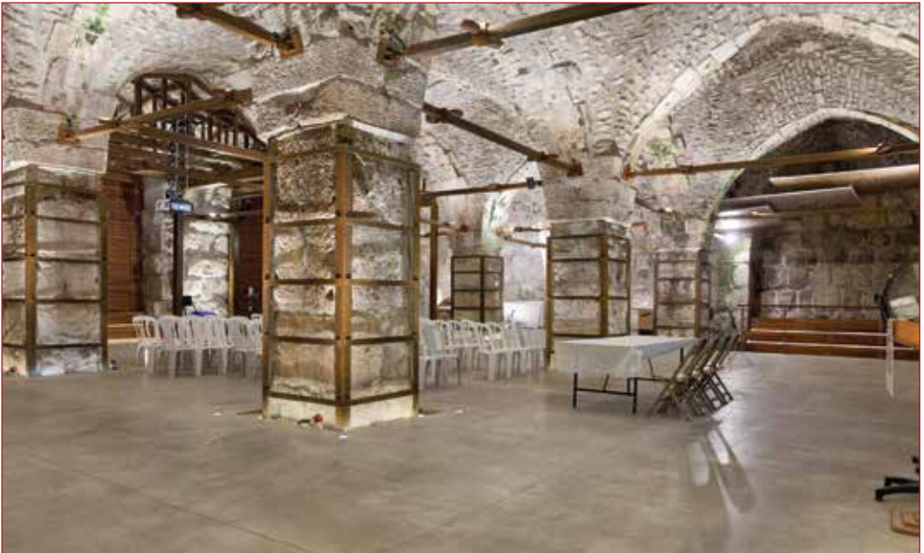
Underground section in Muslim Quarter - Part of Ohel Itzhak area