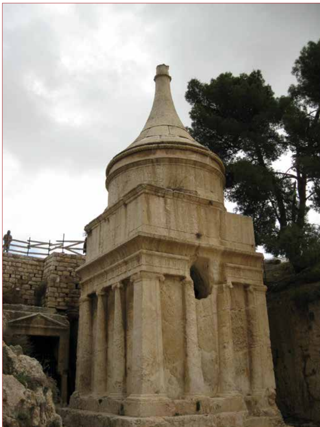
Tomb of Absalom in Kidron Valley