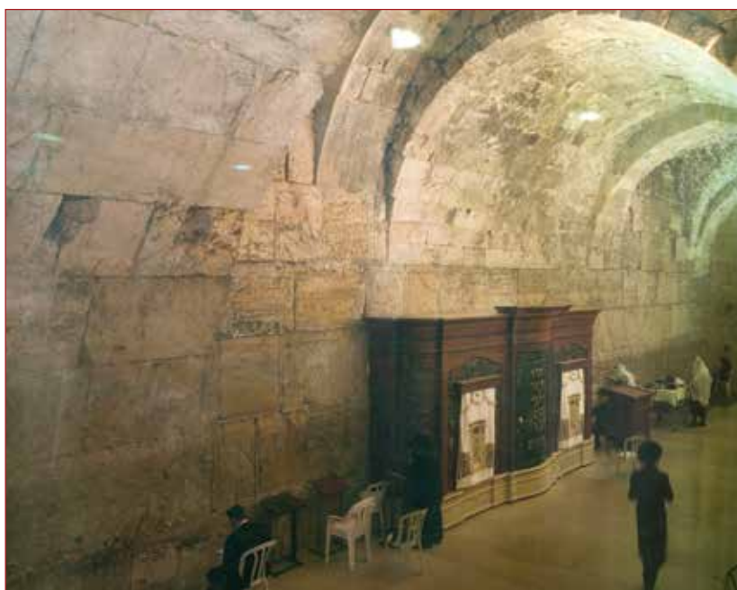
Prayer area under Wilson's Arch abutting the Western Wall Tunnels

In any case, these general crimes appearing in the Penal Code are not an exhaustive replacement for the variety of prohibitions stipulated in the provisions of Par. 170 of the Penal Code, in Par. 2 of the Protection of Holy Places Law, and in provisions 2(a) and 5 of the Regulations for the Protection of Holy Places for Jews.