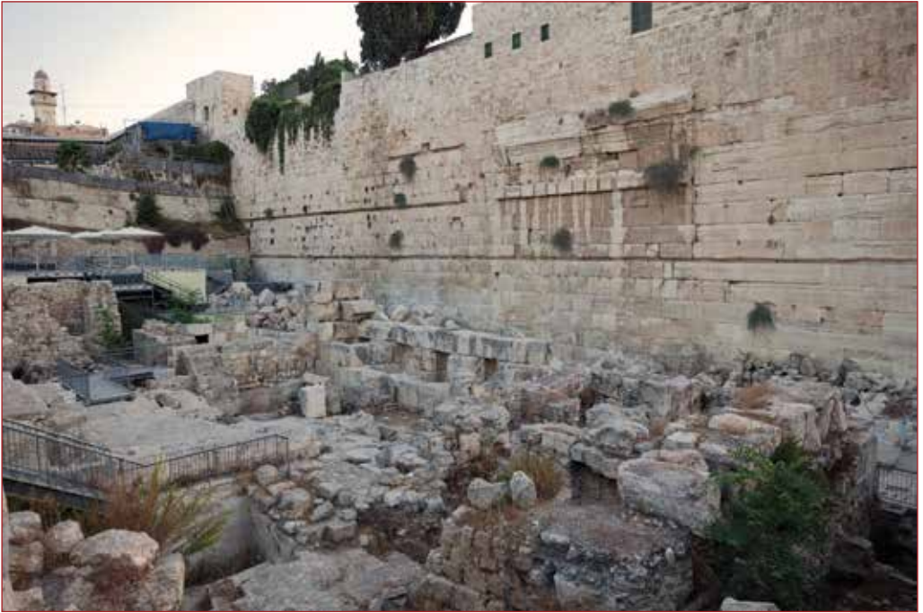
Archaeological area near Robinson's Arch/Davidson Center